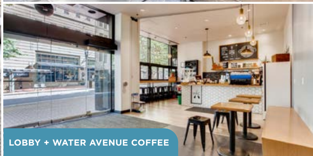
LOBBY + WATER AVENUE COFFEE