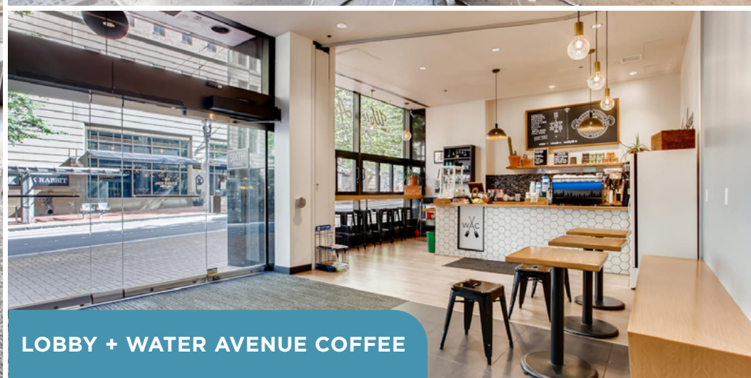
LOBBY + WATER AVENUE COFFEE